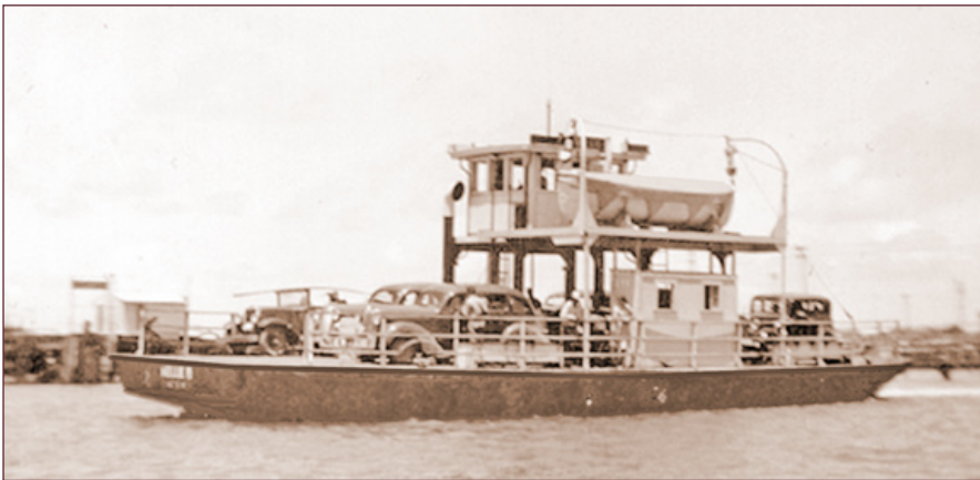
Port Aransas ferries in 1930s

Leave your own mark on Port A. Brick Pavers and Blocks still are being sold to line the walkways to the museum. The pavers measure 4" x 8" and are engraved with 3 lines of 14 characters. The blocks measure 16" x 16" and are engraved with 14 lines of 30 characters. Call Betty Bundy at 361-749-3406 or email ggbun7@centurytel.net for a form.