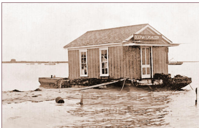
Deep Water Saloon

The "historic" concert will be an annual event. Any band alumni is invited to join in next year.